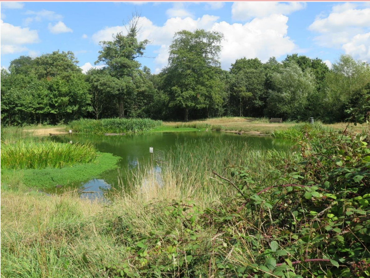
The pond (TQ 193 874) on top of Barn Hill. Photo: Laurie Baker, August 2014