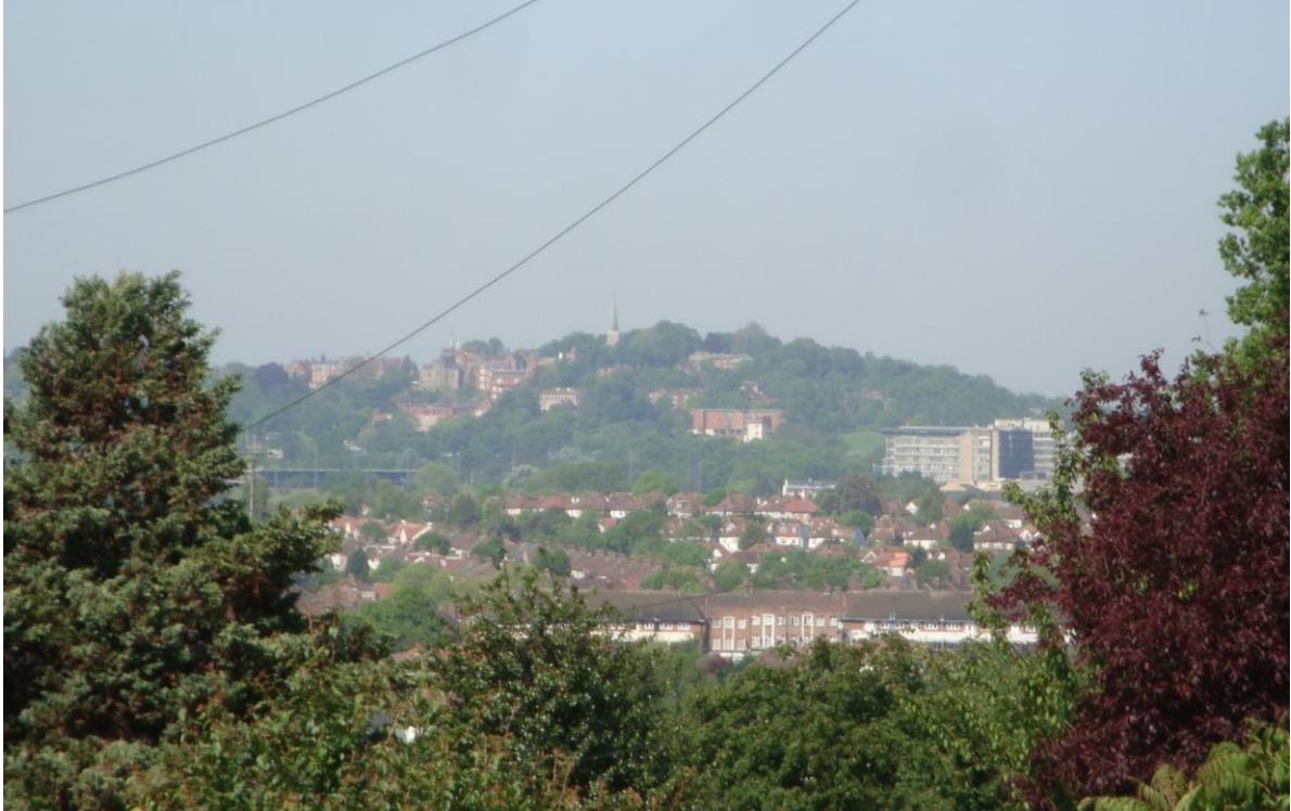
View from near the top of Barn Hill, looking west to Harrow on the Hill, June 2012

An aquatint of Harrow Hill sand pit in 1798 by Frances Jukes can be found on https://tinyurl.com/9mfutztx