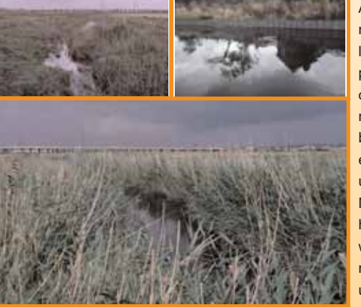
bottom: ditch before grazing. top left: effects of grazing top right: re-enforced banks are not good for water voles