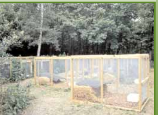
captive breeding pens

Links with industry and statutory agencies will be cultivated. There are plans to strengthen the