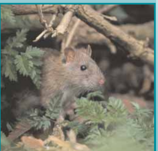
sensitive control of rats can help conserve water voles