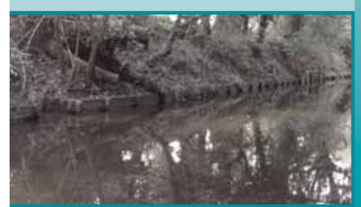
toe-boarded banks, Beverley Brook, Wimbledon Common

Dagenham (Ingrebourne, Rom and Beam), the river Crane (Hounslow/Richmond) and the Colne valley to the west of the region. Within the Lee Valley Regional Park there are some