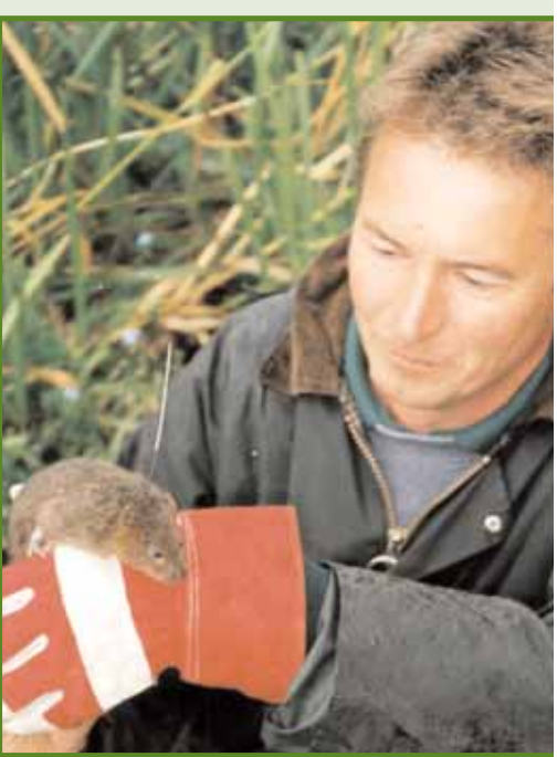
water vole fitted with radio collar

this wonderful species, especially the enthusiasm, commitment and creativity shown in response to achieving goals within such a challenging and dynamic urban environment." Environment Agency