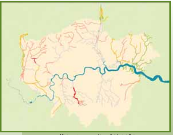
Water voles present in suitable habitat – green Water voles present, priority conservation work needed – voltow Some suitable habitat but water voles absent – pink Currently unsuitable for water voles – grey Future potential for re-introduction – red

legal protection for this species. Greater awareness will need to be raised among landowners, land managers and developers to ensure conservation action is appropriate, effective and co-ordinated.