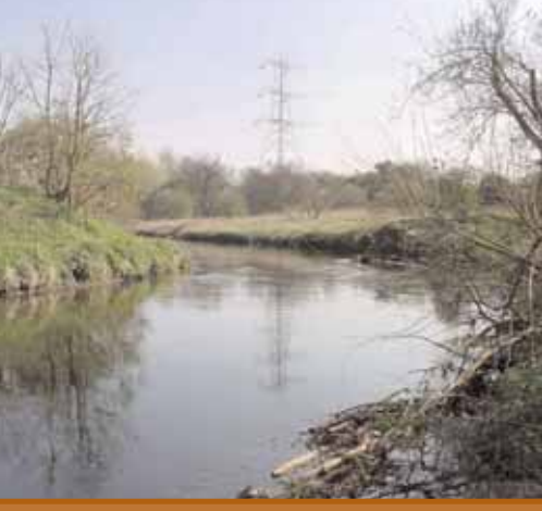
the London Wetland Centre

1. fencing for livestock Silvermeads, Lee Valley Regional Park